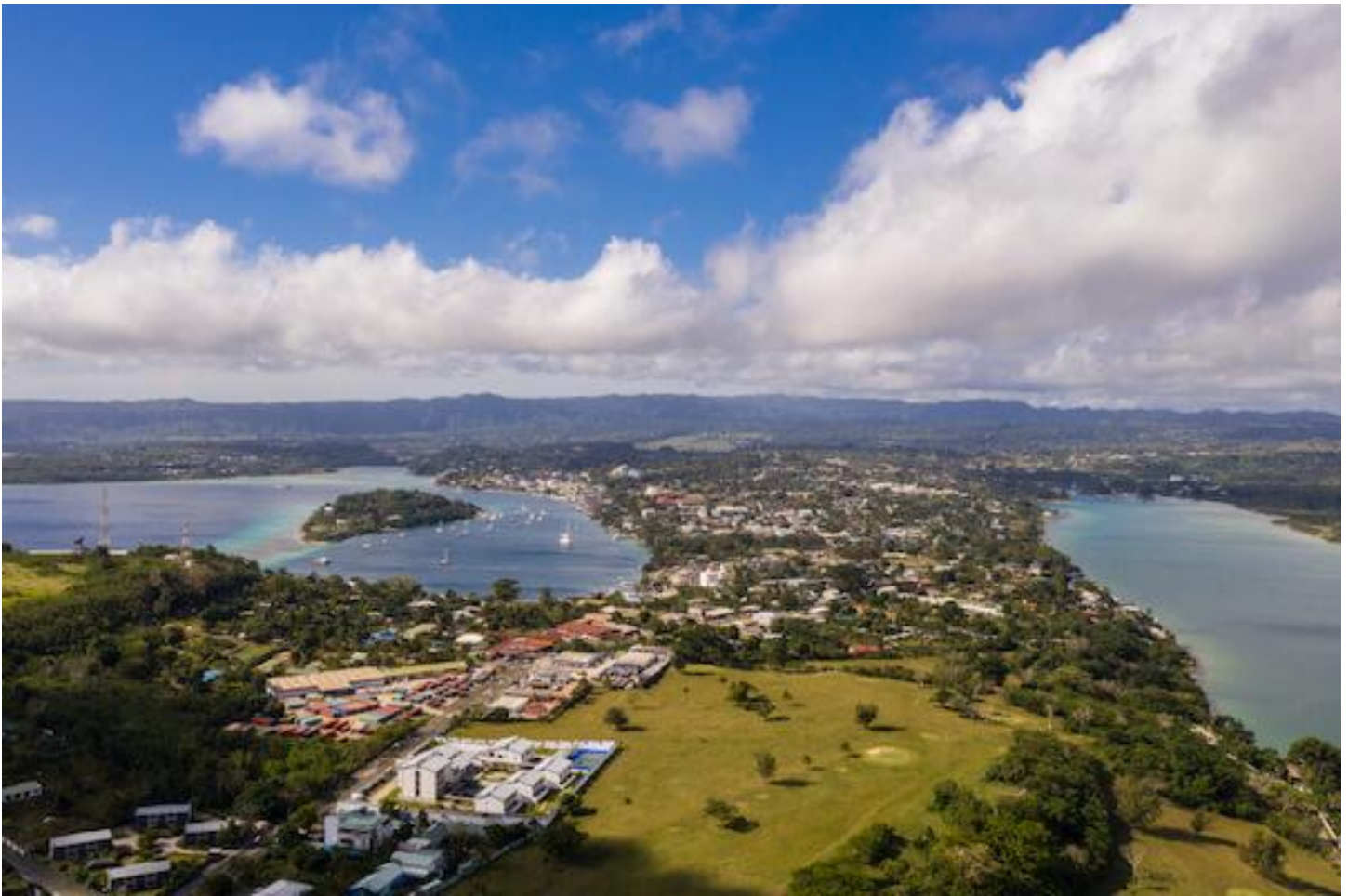
Aerial view of Port Vila, the capital city of Vanuatu

6. Vanuatu was first inhabited by Melanesians as far back as in 2000 BC. In the 15th century, the islands were visited by various explorers and later settled by British and French settlers.