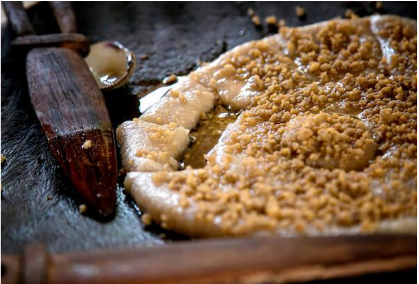
Lap lap is a Typical Vanuatu Dish

Lap-lap is baked in banana leaves. This Vanuatu dish is made by grated root vegetables such as taro and yam. The paste of the grated roots and mashed bananas are then made into a dough which is then covered by coconut milk and cabbage and more dough layered on top. Sometimes cooked meats such as beef or pork or fish is then added on top as well before baking the whole wrapped dish in a rock oven.