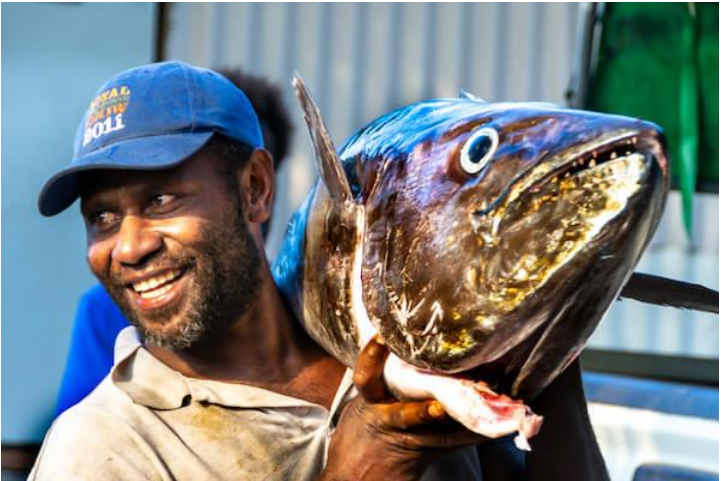
Vanuatu fisherman

The main agricultural products also include tropical fruits such as pineapples and bananas, cabbage, vanilla, cocoa, coconuts, and yams or taro (which is a starchy root vegetable).