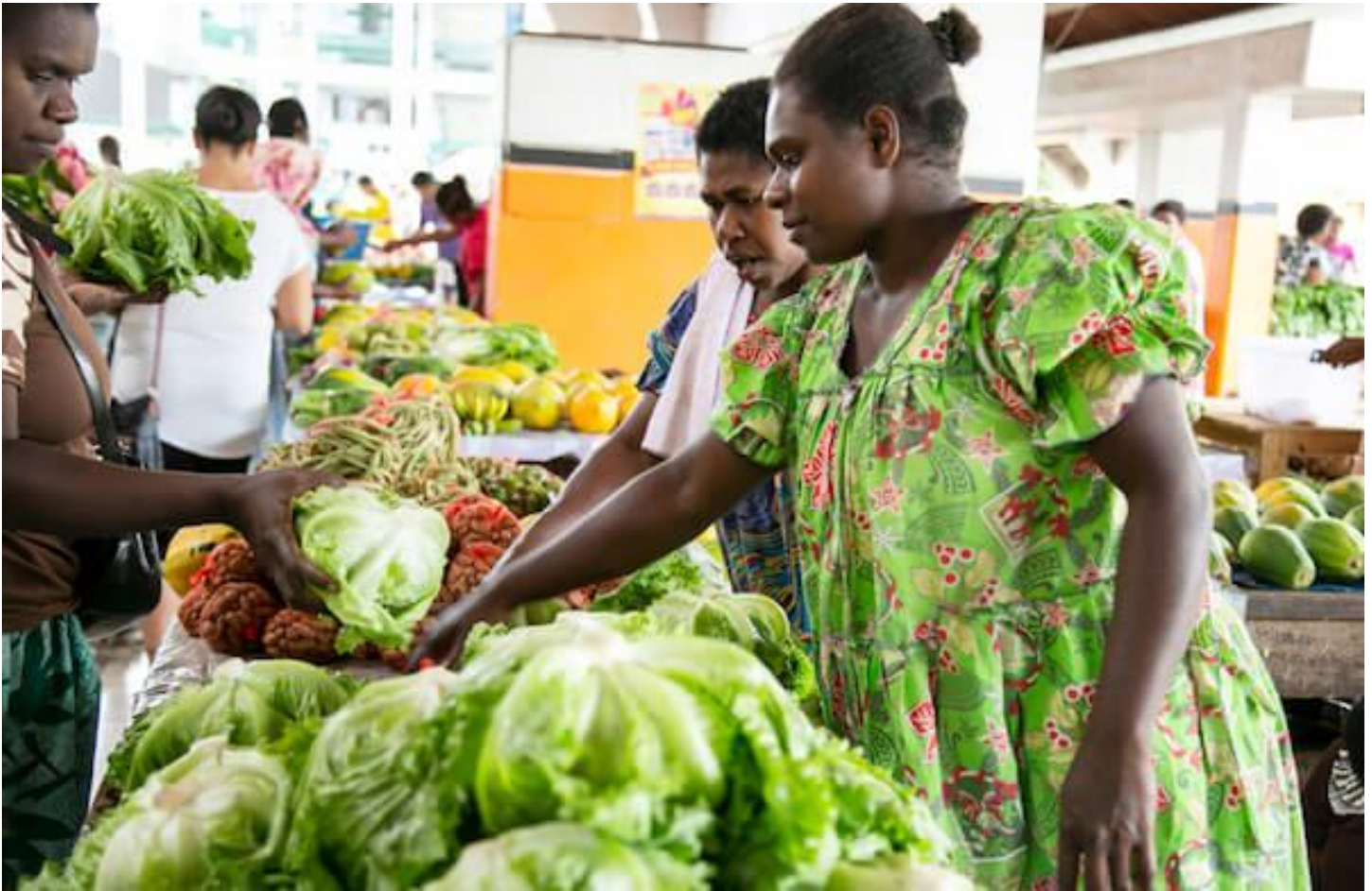
At the Market in Vanuatu

The main export partners are the Philippines, Australia and the USA, while Russia, Australia and New Zealand are the main import partner of Vanuatu.