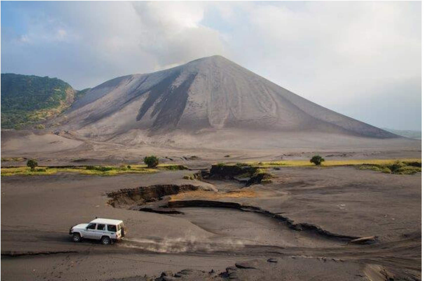
Volcanic earth on Vanuatu

Some islands have active volcanoes and most of the islands are rocky or even mountainous. One of the most active volcanoes is Mount Yasur on Tanna island.