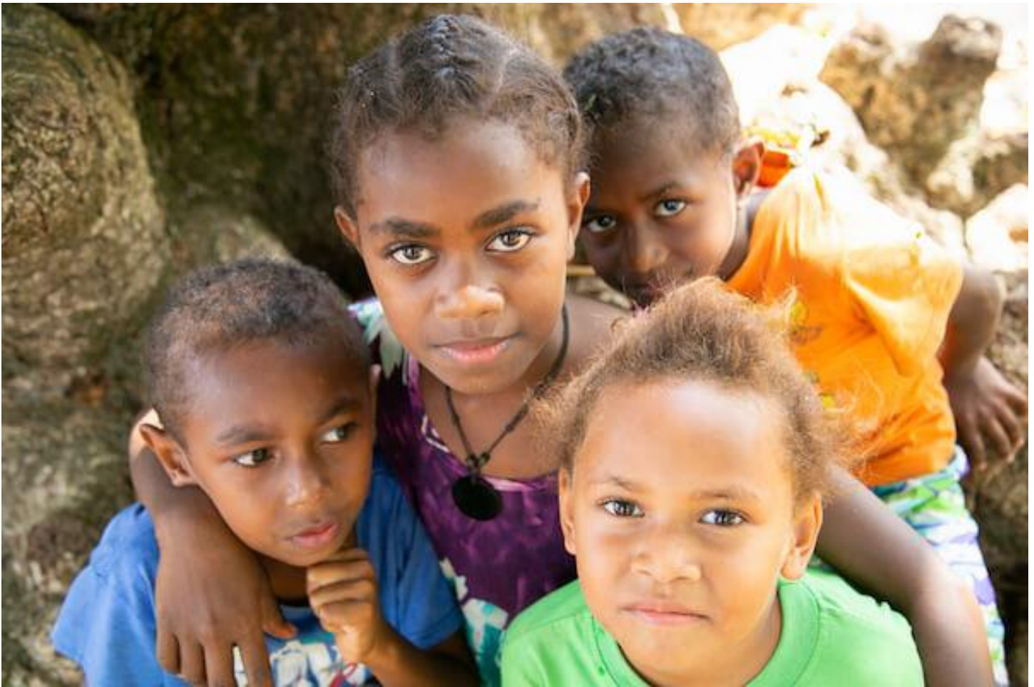
Children in Vanuatu

8. The national languages of Vanuatu are Bislama, English and French. Bislama is a Creole language and spoken by all Ni Van either as first or second language.