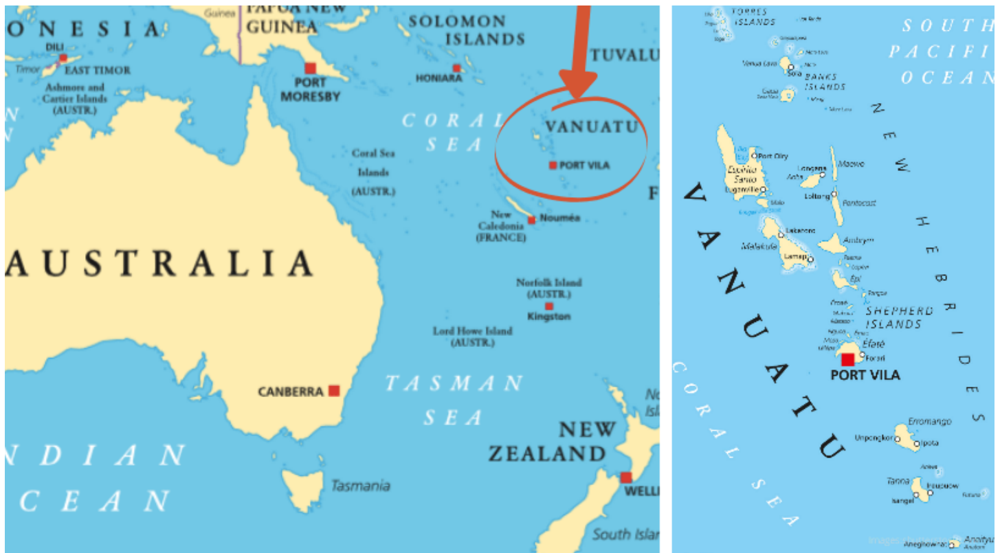
Maps of Vanuatu and her islands

and the Solomon Islands - parts of Indonesia and French New Caledonia also belong to Melanesia.