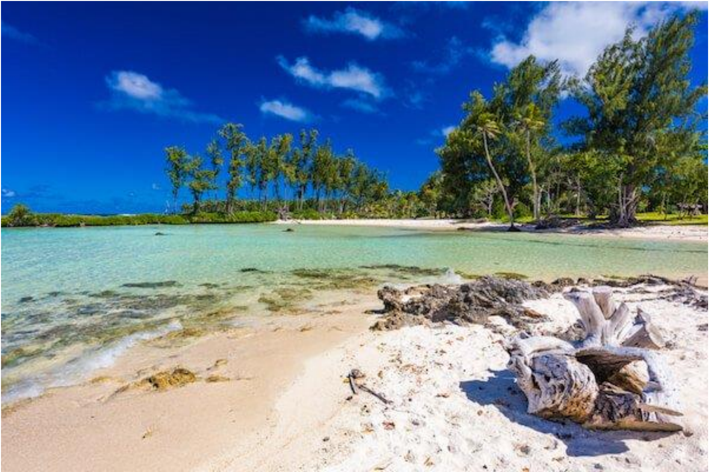
Eton Beach in Vanuatu

15. Food in Vanuatu includes the different fruits and vegetables grown on the islands. Coconuts and coconut milk is used in many dishes. Food is mostly steamed or cooked over fire and rarely fried.